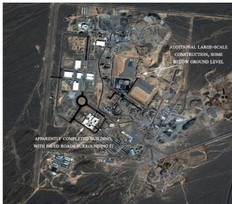
Caption: Gorgan al-Kabir Center.

This is not the first time the NCRI has ascertained the location of one of Tehran's undeclared facilities since it was they who revealed in 2002 the existence of a uranium enrichment plant at Natanz and a heavy water plant at near Arak.