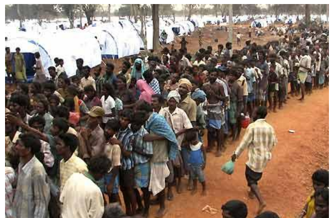
Associated Press, April 26 2009.

One of the tragic outcomes of the final push by the Sri Lankan military was the deaths of over 20,000 Tamil civilians, according to The Times (30 May, 2009) from a top-aide to the UN Secretary General. Disturbingly the UN disclosed figures in April 2009 that were significantly less at 7,000 and subsequently the Human Rights Council was severely criticised for apparent non-action ( The Times , 30 May, 2009). After the resounding defeat