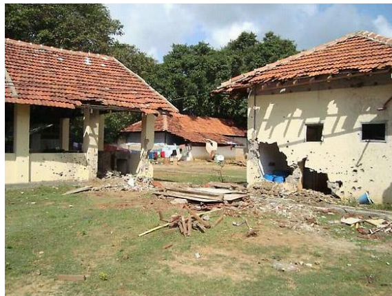
Hospital in Sri Lanka hit by artillery for several days before being evacuated.

On 23 May 2009, UN Secretary-General Ban Ki-moon paid a visit to Sri Lanka, which was concluded with a joint communiqué with the government of Sri Lanka. It outlined a number of points both parties recognized as necessary to the post-conflict phase: