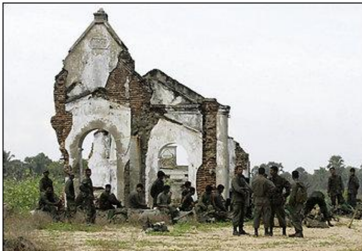
29 January 2009

The current situation has spiralled into bickering over a plan by Secretary General Ban Ki-moon to send a panel of experts to the country. The current President Mahinda Rajapaksa has condemned the plan, as he sees the allegations of human rights abuses as "misrepresentations" stirred up by LTTE supporters. 1 Meanwhile there are concerns that many activists could be charged over what the International Bar Association says has amounted to listings over "levels of dissent", while Amnesty International has labelled the post-war period a "witch-hunt". 2